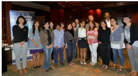
Photos from workshops in Malaysia and Singapore in 2013.